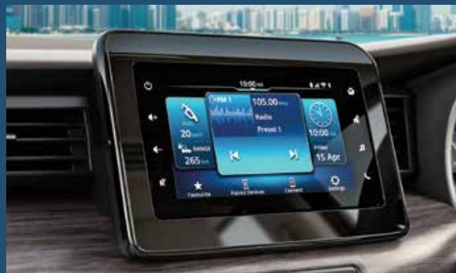
17.78cm Smartplay Pro Connect with your world with just a voice command - "Hi Suzuki".