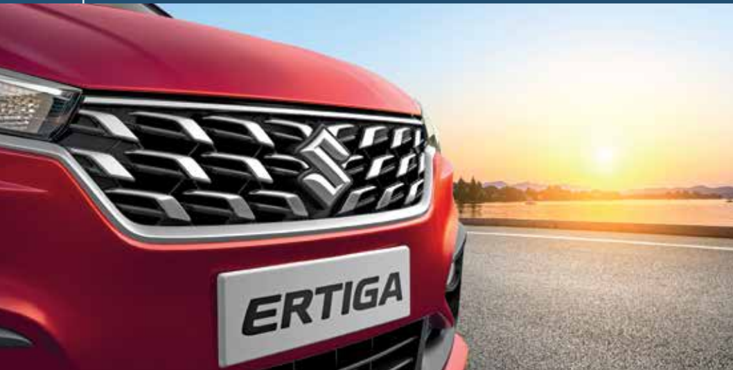
Dynamic Chrome Winged Front Grille The most stylish way to make an entrance.

● Elegant from every angle, the Ertiga is designed to bring out the stylish side of togetherness.