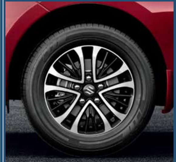
Machined Two-Tone Alloy Wheels Make a statement, every time.