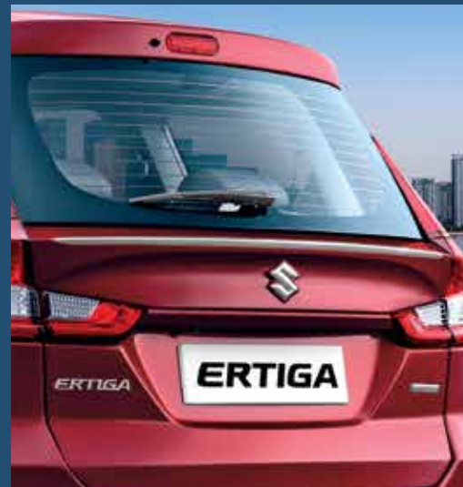
New Back Door Garnish with Chrome Insert Let those second looks chase you.