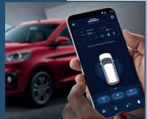
Connected Car Technology with Suzuki Connect Always stay connected with your car.