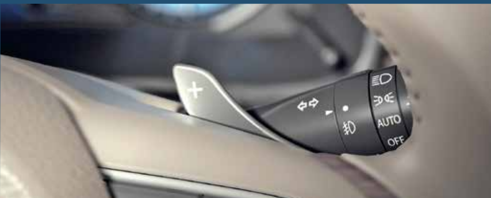
6-Speed AT with Paddle Shifters Surge ahead by engaging the smart paddle shifters.

● Togetherness, driven by technology. The Ertiga is equipped with state-of-the-art technology to add more fun to your moments of togetherness.