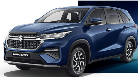
NEXA BLUE (CELESTIAL)