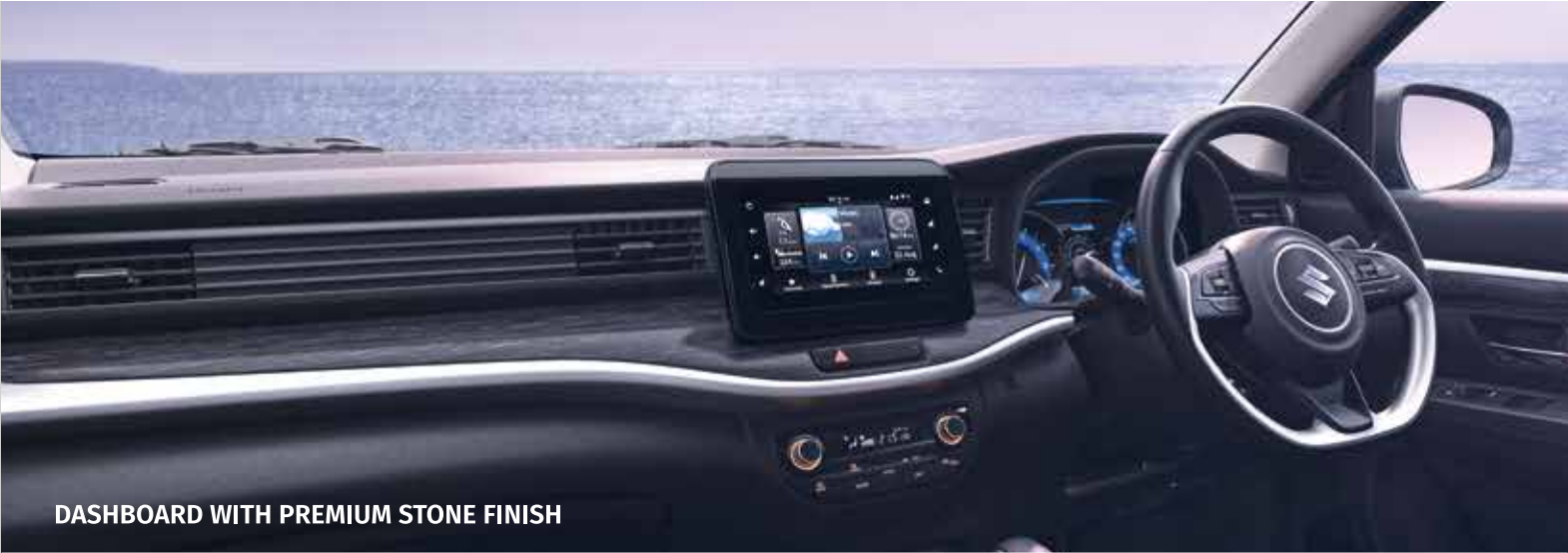
DASHBOARD WITH PREMIUM STONE FINISH

Featuring a distinct new Front Chrome Grille with a Sweeping X-Bar that flows smoothly into the Quad Chamber LED Headlamps as LED DRLs, the All-New XL6 makes its presence felt. The distinct hood is complemented by aggressive shoulder lines that firmly highlight its body contours and seamlessly flow into the Smoke Grey LED Tail Lamps, carrying the powerful design from the front to the rear. Sporty Roof Rails, a Back Door Spoiler and the new Shark Fin Antenna radiate an unmistakable sense of style while the striking Dual-Tone Machined-Finish R16 Alloy Wheels evoke a sense of stability whenever you take it out for a spin.