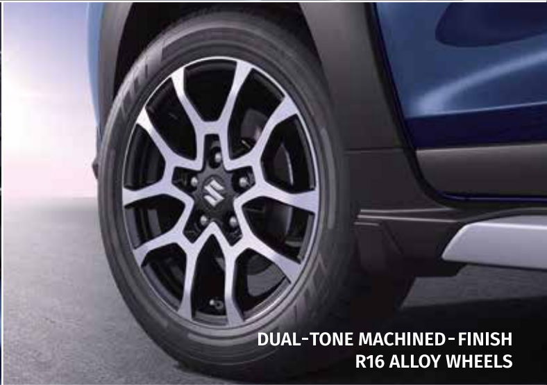
DUAL-TONE MACHINED-FINISH R16 ALLOY WHEELS