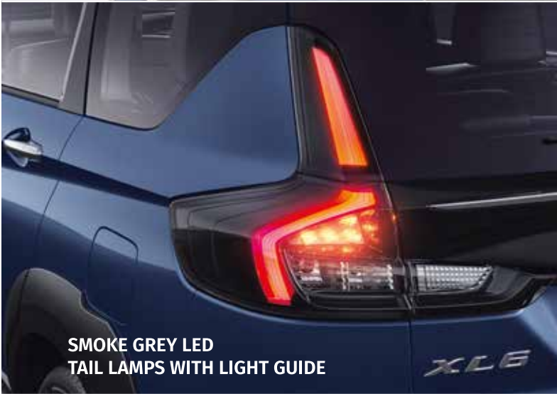
SMOKE GREY LED TAIL LAMPS WITH LIGHT GUIDE