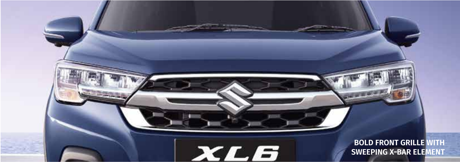
BOLD FRONT GRILLE WITH SWEEPING X-BAR ELEMENT