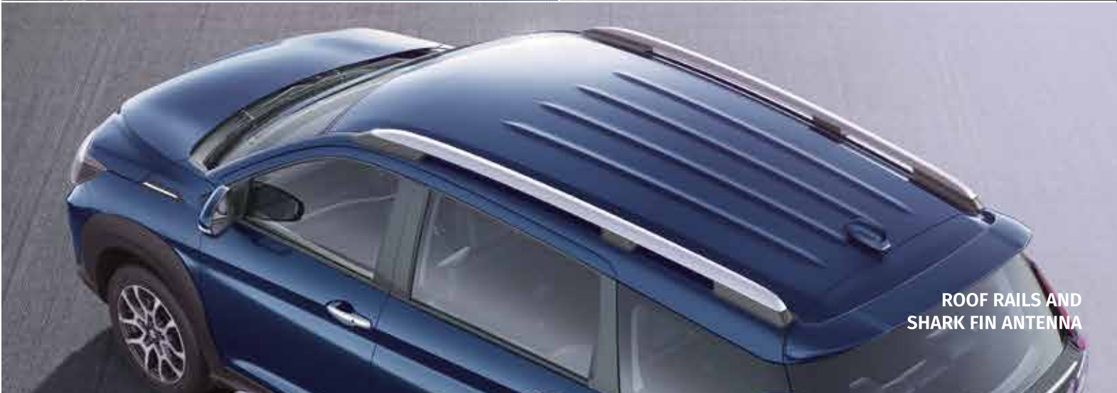
ROOF RAILS AND SHARK FIN ANTENNA